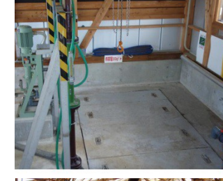
Membrane Tank (Expanded)