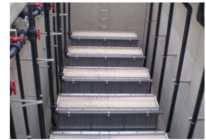
Installed View of Membrane Units