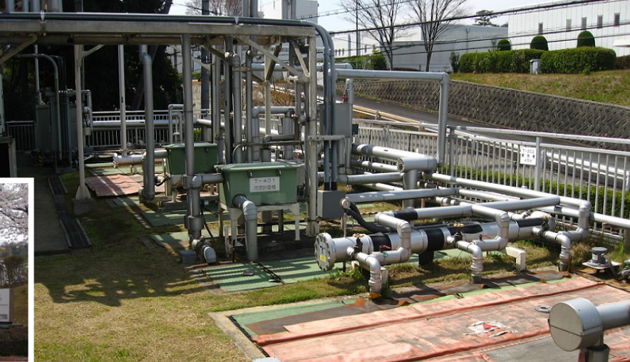
Overview of Wastewater Treatment Facility