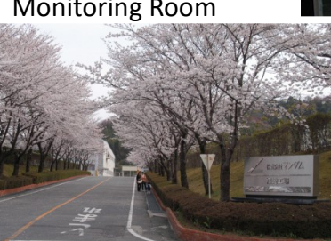
Customer's Main Gate